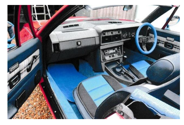
CAR - TR V8/3.5L/SDI ENGINE/1980/97k/5 SPD GEARBOX/CONVERTED IN 1985 BY GRINNALS/NO RUST.

The V8 engine benefits from a Kent high-lift cam and sounds quiet and smooth (for a V8!!)