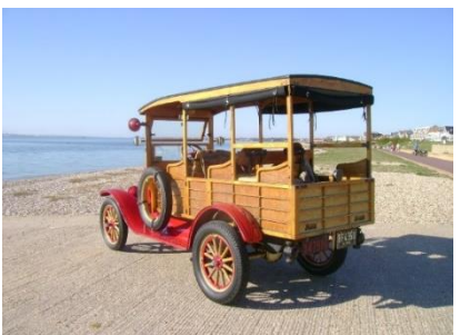
to include indicators. Rear seat

tilts/removes to convert into truck. Very usable and fun 'T'. New project forces reluctant sale. Asking £11,500. Tel. Ray Evans 01489 589844-----